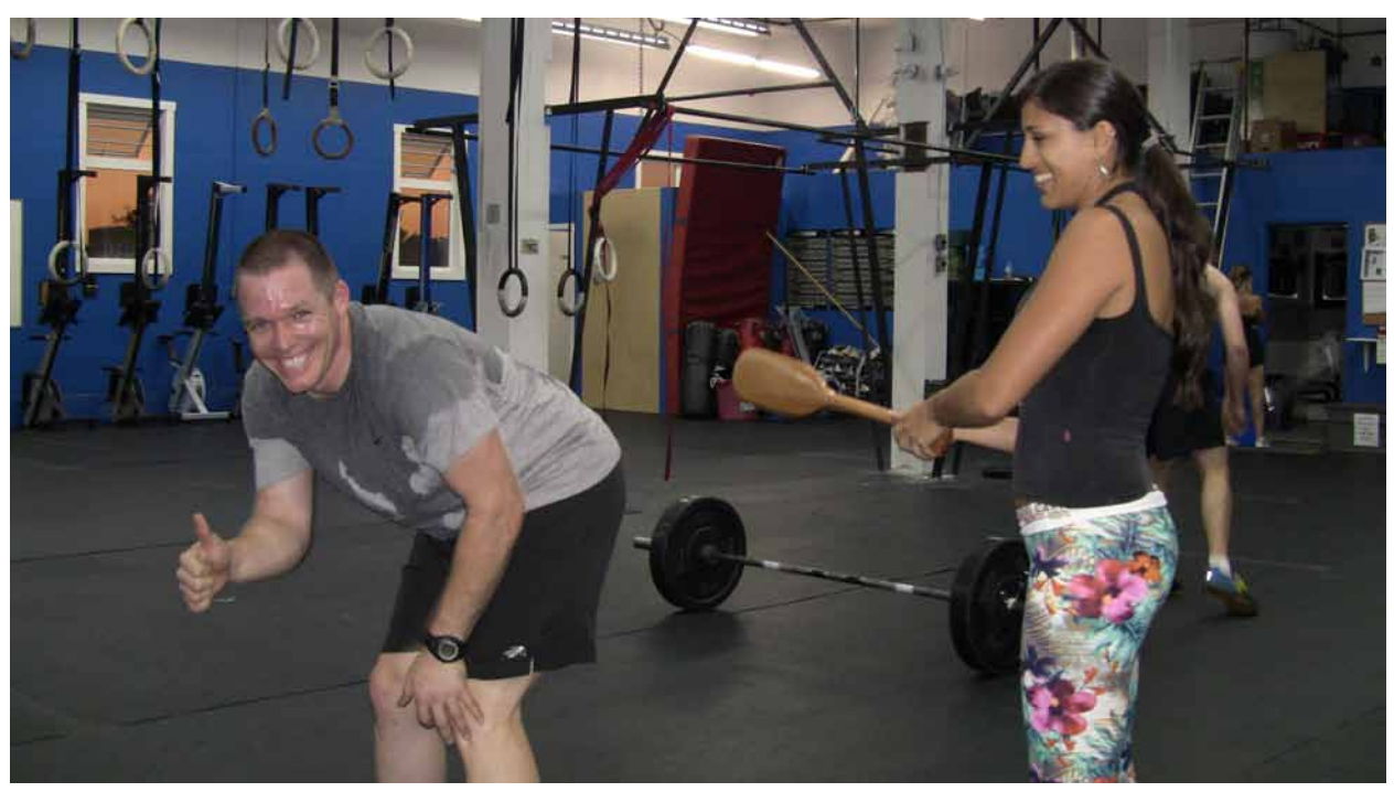
Functional movements performed at high intensity can sometimes be enjoyable.

Whether due to spiritual compatibility, a shared way of thinking, compatibility in gift giving and communication or just plain old primal attraction and great hard-bodied sex, CrossFit couples just seem happier to me.